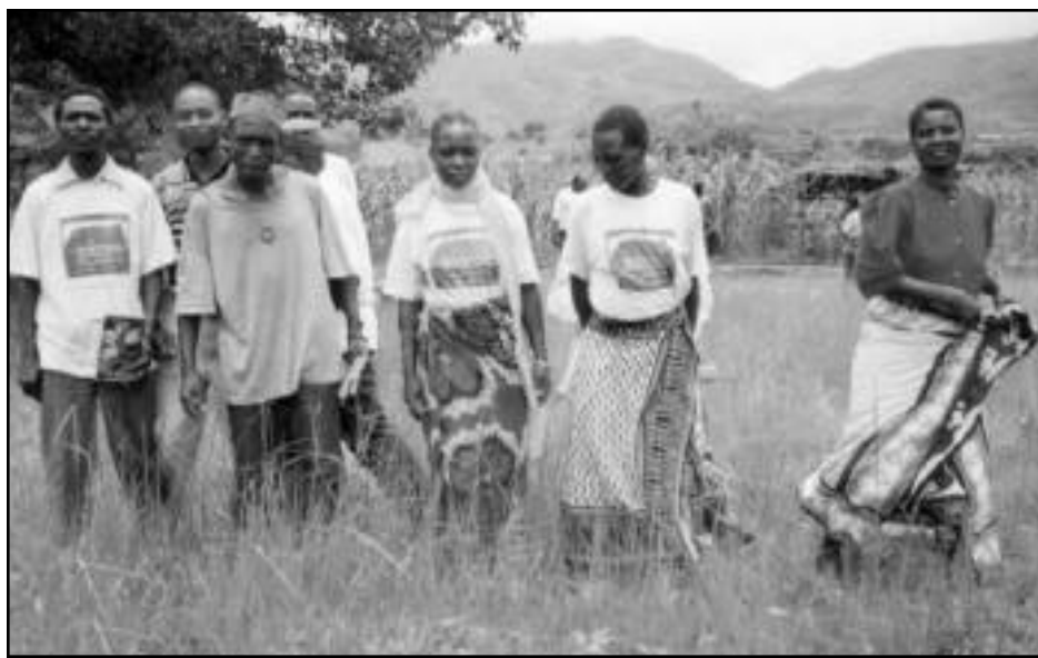
Natural Resources Committee in WKSFR

A key focus for the project has been on capacity building for the Village Natural Resources Committees and assisting them to develop a management plan for the joint management area of the WKSFR. The area under PFM is determined by the evergreen forest on the peaks of Ndundulu and Nyumbanitu as part of WKSFR. It was agreed in the management plans that the adjacent communities would be involved in managing the peaks which constitute 5,000ha of the 104,000ha of the whole forest reserve.