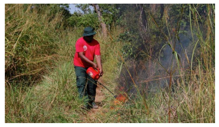
MCDI staff member conducting early burning in Likawage Village in 2014, using a drip torch. It was very hard to start the fire because of the very wet grasses.