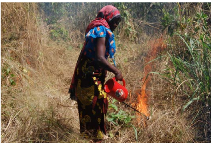
Participation of women in early burning in Likawage Village in 2014 (Abigail Williams)