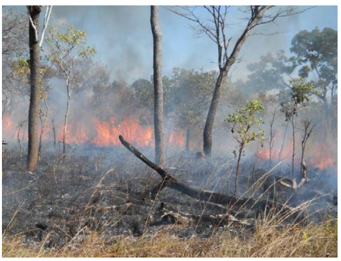
Early burning in Likawage Village in 2013 (Glory Massao)