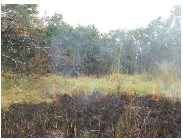
Early burning in Nainokwe Village in 2014