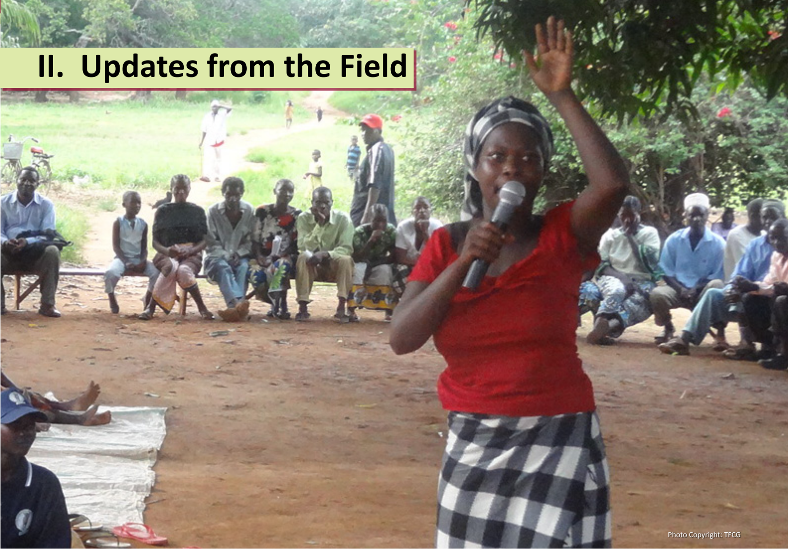
REDD+ pilot project updates are submitted by project staff on a periodic, voluntary basis for information sharing at a broader level.

A forthcoming report and related briefing will review developing benefit sharing mechanisms and early lessons from the national REDD+ pilot projects. Look for more details in the next newsletter!