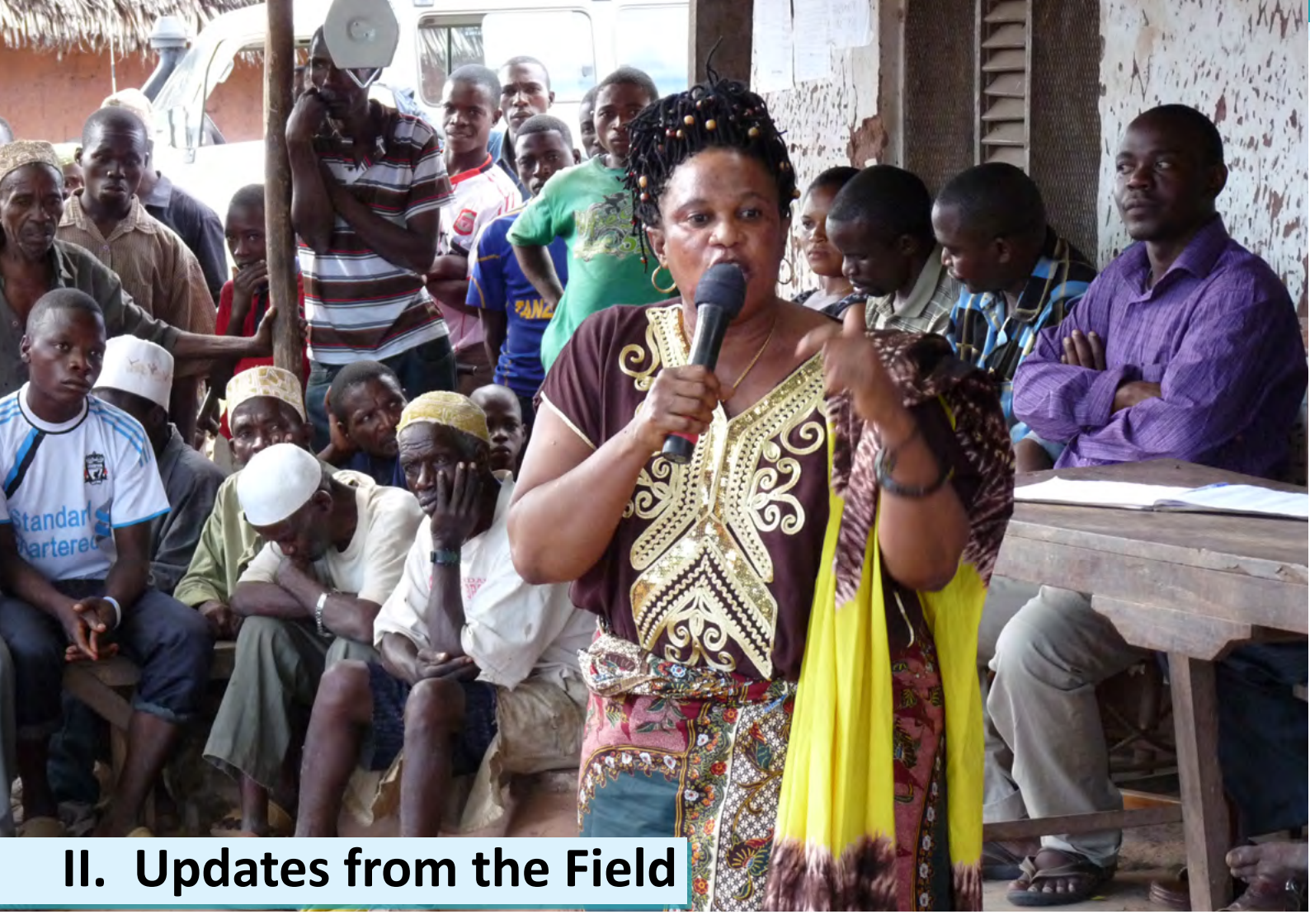
REDD+ pilot project updates are submitted by project staff on a periodic, voluntary basis for information sharing at a broader level.