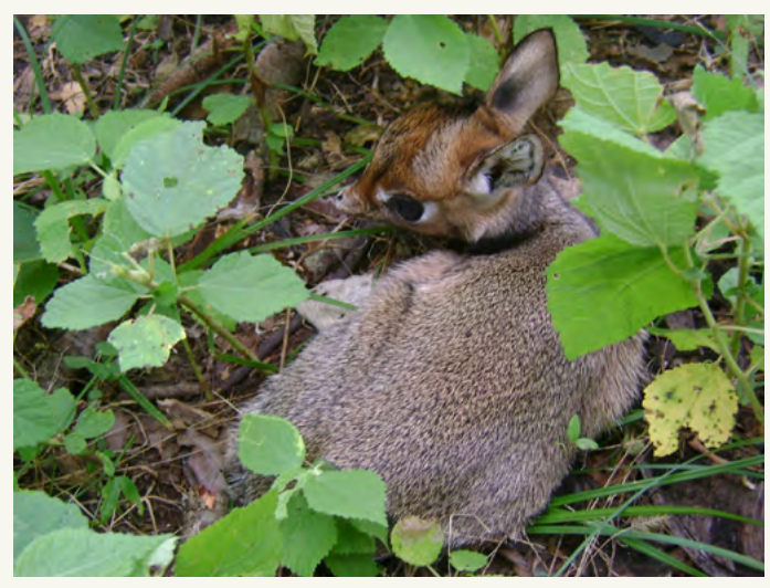
Wild animals are steadily returning to Kolo Hills Forests as a result of improved forest management and conservation.