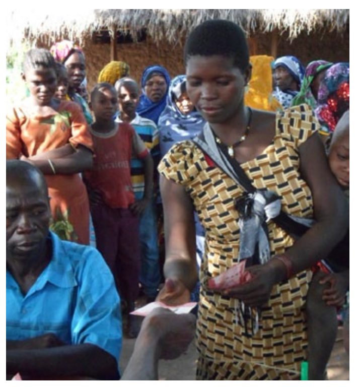
A mother receiving individual dividends for herself and her dependents in Ruhoma village.

For more information about the project please visit www.tfcg. org/makingREDDWork.html