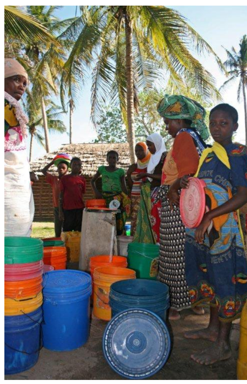
Photo: Women from Kikole village collecting water from their new bore-hole, partly financed from PFM revenue.

Communities are already benefiting from timber sales conducted under MCDI's FSC certificate.