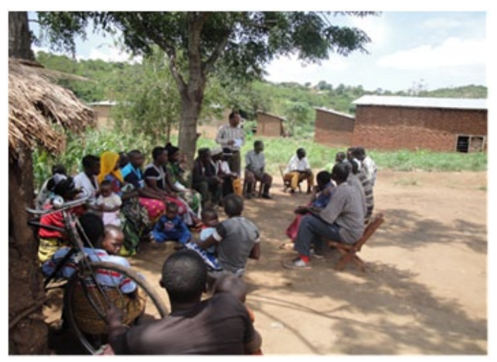
Villagers being informed about REDD activities in TFCG/MJUMITA project.

Learn more about the project here: http://www.tfcg.org/makingReddWork.html