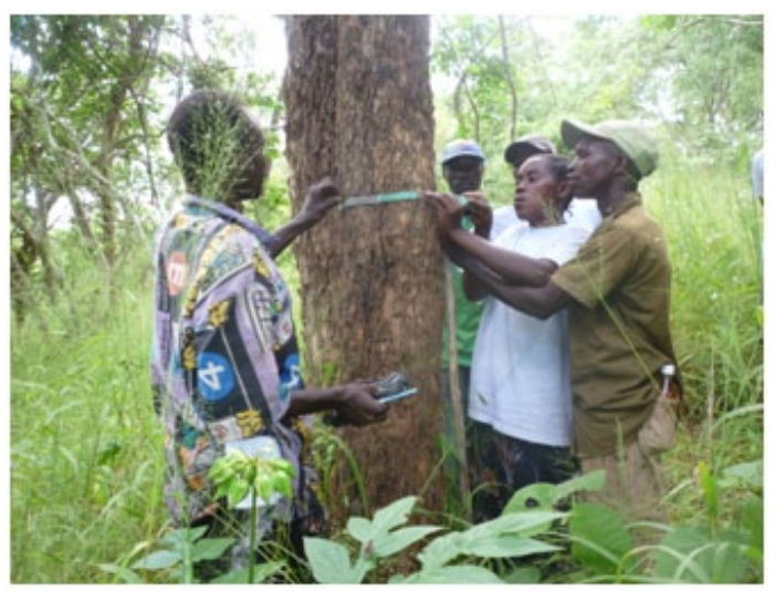
Villagers in Ruhoma Village in Lindi getting practical knowledge of assessing carbon.

the development of a project design document for the Voluntary Carbon Standard. Over the last six months their remote sensing team has been carefully analysing Landsat 5, SPOT and PALSAR images and carrying out ground-truthing in order to develop landcover classifications for the two sites and their reference regions. The team have faced and overcome various technical hurdles including dealing with cloud cover and shadow in the images; seasonal changes in vegetation; and distinguishing between forest and fallow areas. Classification of both landscapes has now been completed.